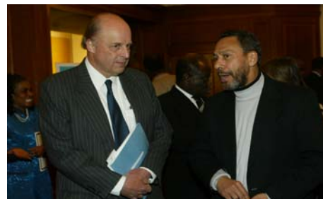
US Ambassador to the UN, John Negroponte, speaking with Congressman Mel Watt